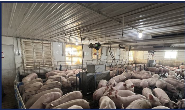
Tunnel Fan End