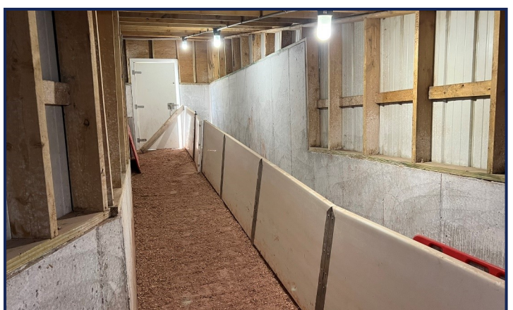
Interior Load Chute