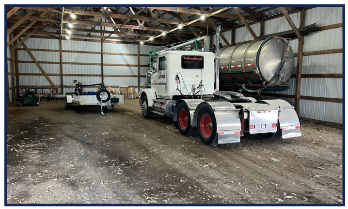
Interior of machine shed