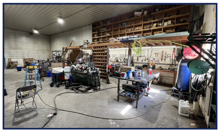
Interior of Heated Shop