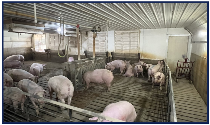
Tunnel Fan End