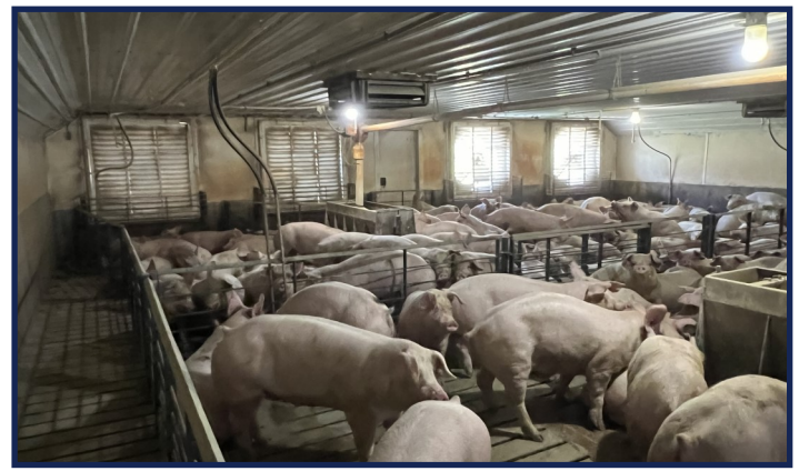
Tunnel Fan End