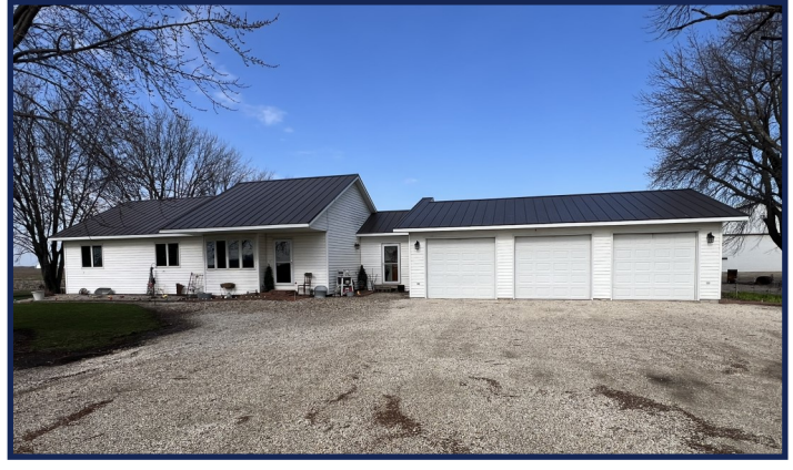
House with attached 3 stall garage