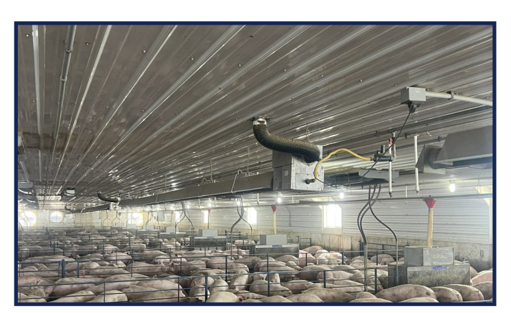
Ceiling Tube Heater