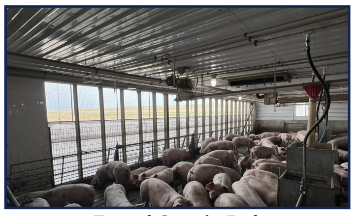
Tunnel Curtain End