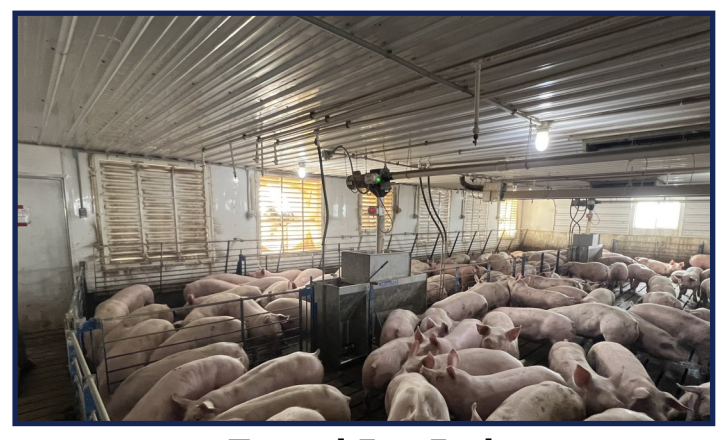
Tunnel Fan End