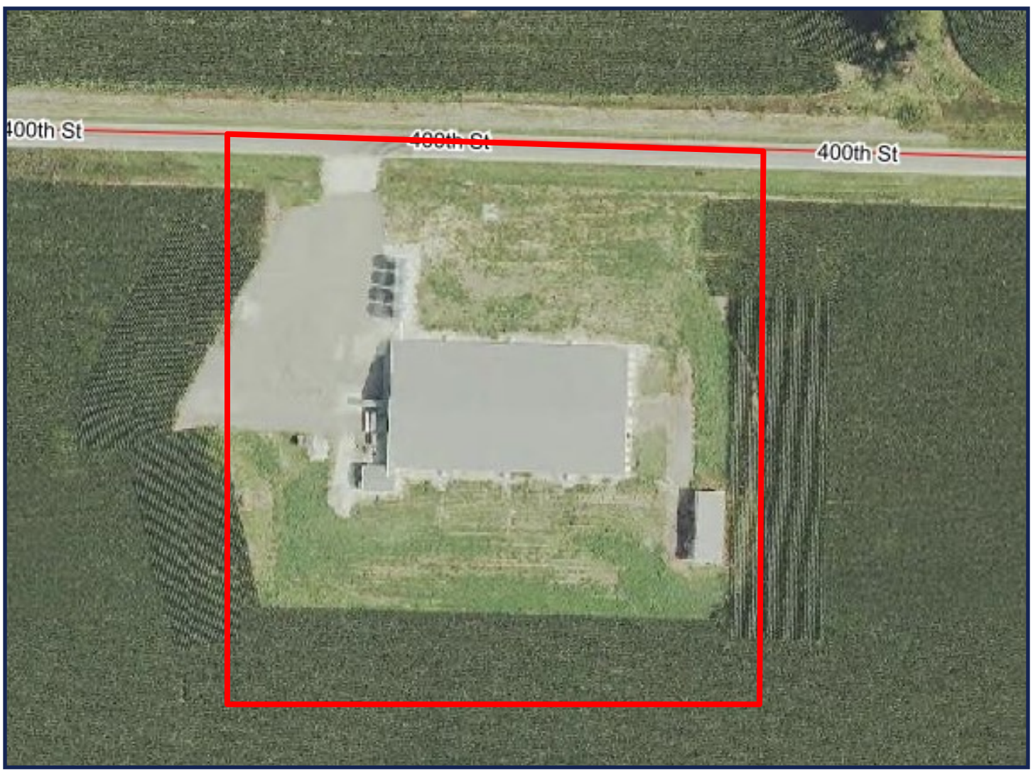
*Exact boundaries pending survey