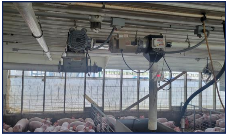
Feed Auger System