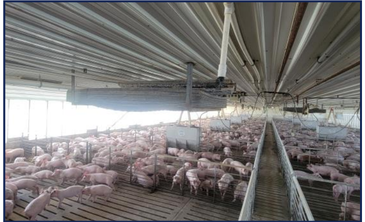
Wean Mats and Racks