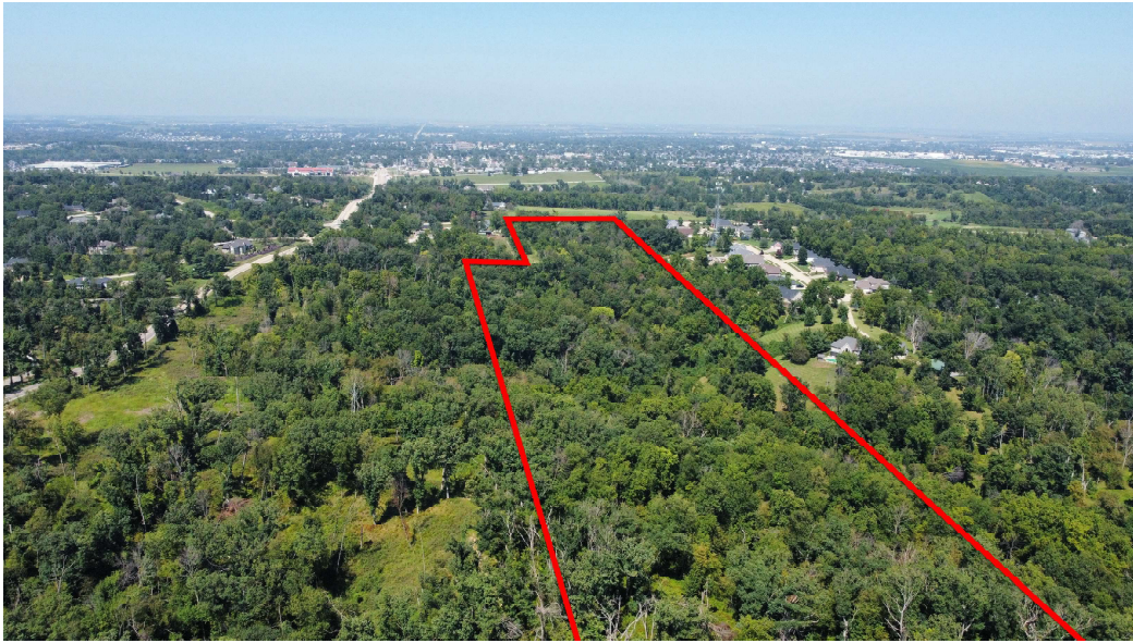
Southwest corner looking northeast

Linn County - 30 A M/L 4601 Lakeside Rd, Marion, IA