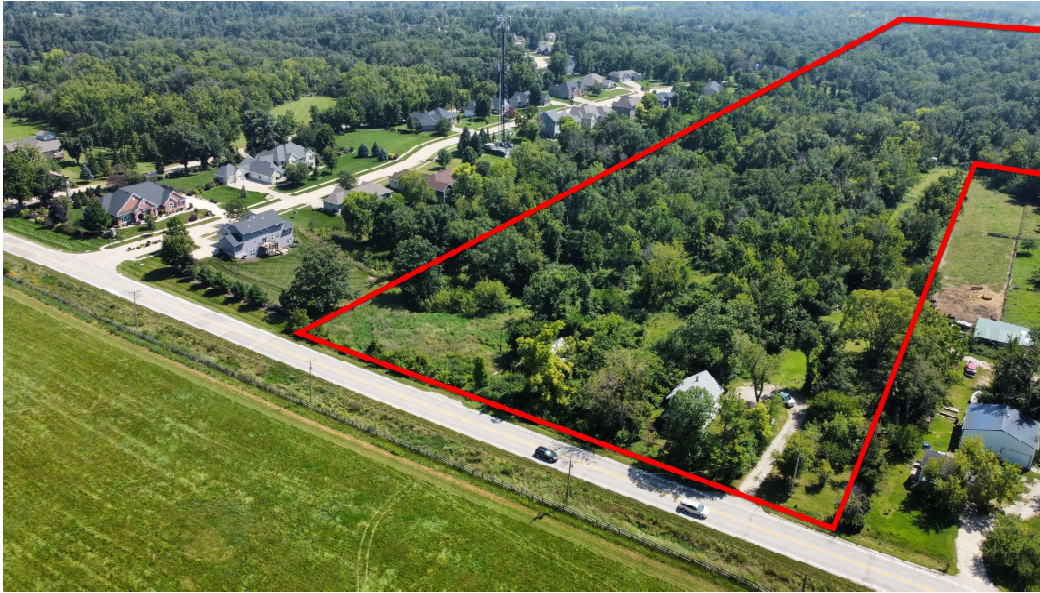
Northwest corner looking southeast

Linn County - 30 A M/L 4601 Lakeside Rd, Marion, IA