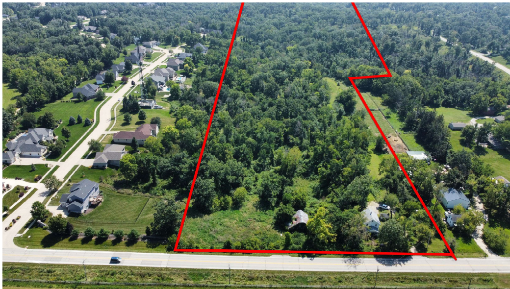
North border looking south