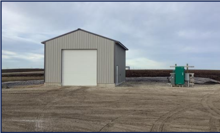
Insulated Storage Building