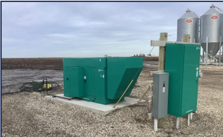
80 KW Site Generator