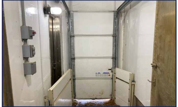
Room Load Out