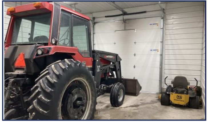
Site Tractor & Mower