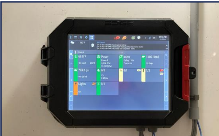
Site Room Controller