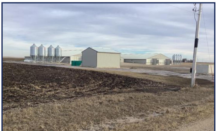
View from Road