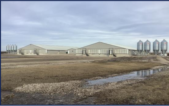
4800 head Swine Site