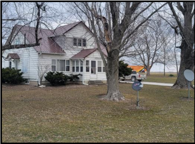
View from 275th St