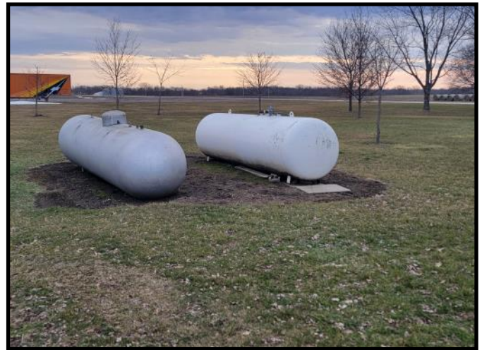
Back Yard of House With Two LP Tanks