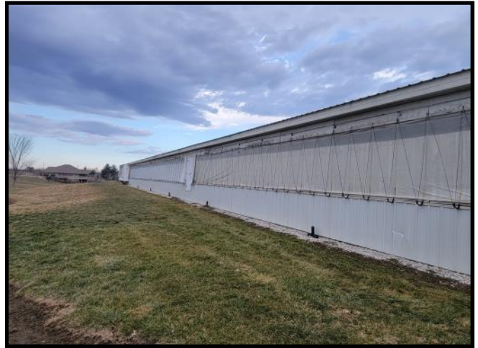
41' X 208' Convertible Swine Barn