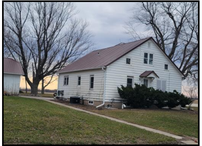
Rear of Home