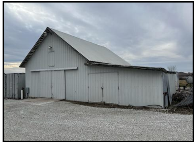
Crib and Small Shed

The information gathered for this brochure is from sources deemed reliable, but cannot be guaranteed by Growthland or its staff. All acres are considered more or less.