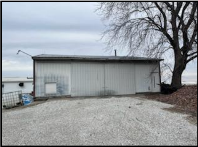
40' X 40' Machine Shed