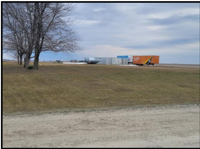
1.6 m/l Acres East of House