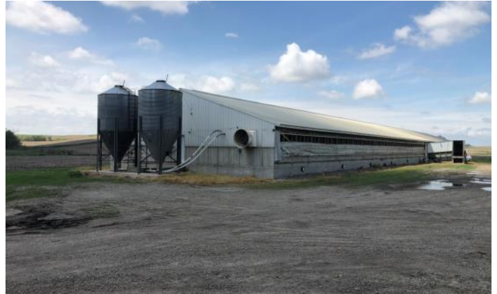
View of Site 8