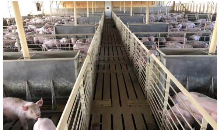
Interior of Site 8