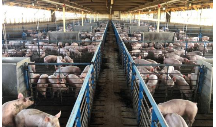
Interior of Site 2