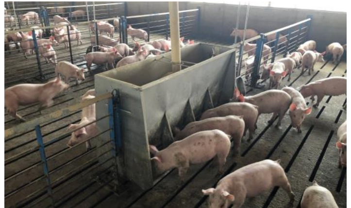
Typical Feeder & Water Cup in Site 1