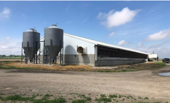
View of Site 6