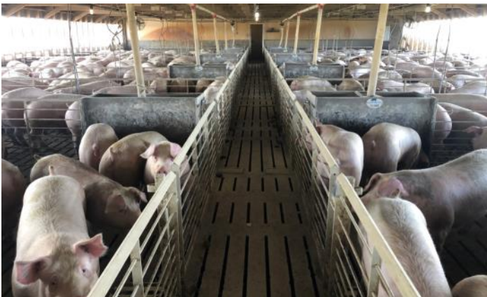
Interior of Site 6