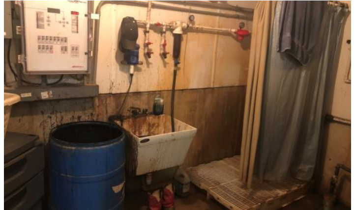
Office Area in Site 3