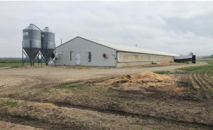
View of Site 10