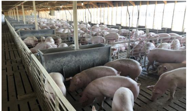
Typical Pen Design