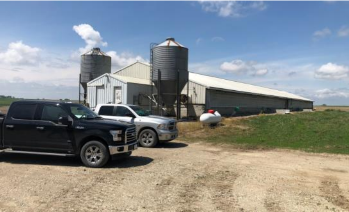
View of Site 1