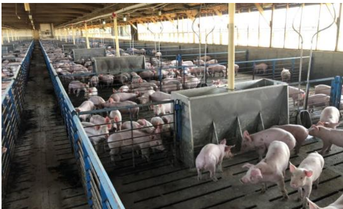
Typical Pen Design Site 2