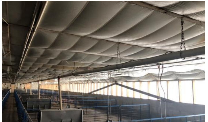
Tri-Ply Ceiling in Site 5