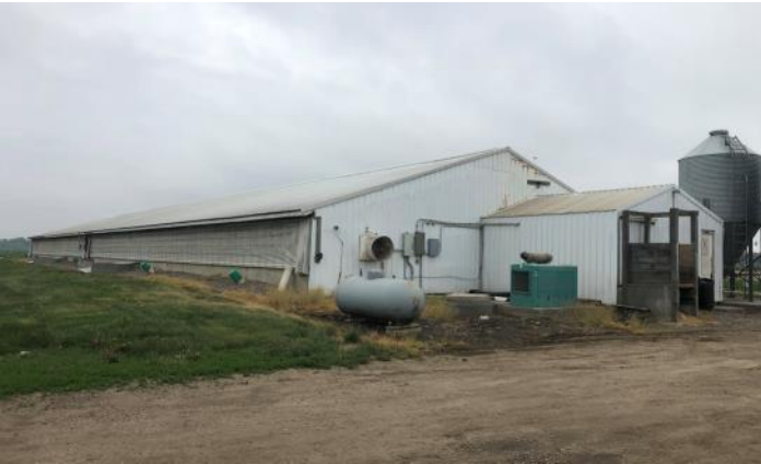
View of Site 3