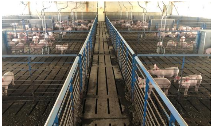
Interior of Site 4