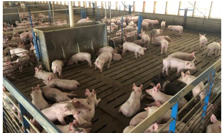
Typical Pen Design