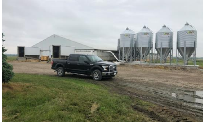
View of Site 5