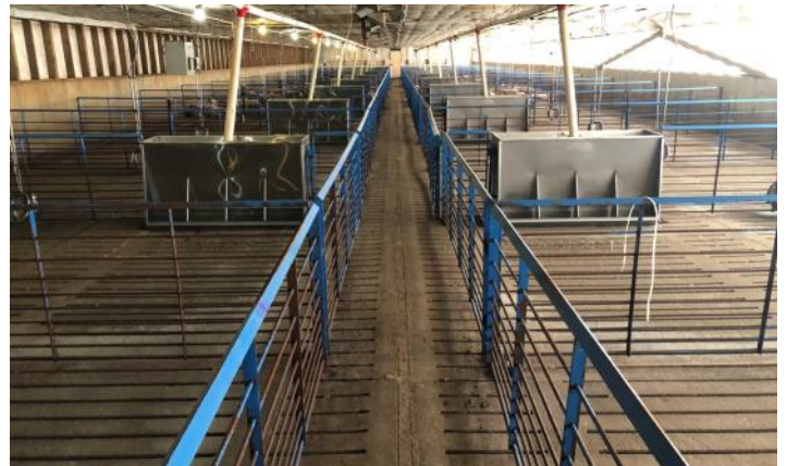
Interior of Site 5