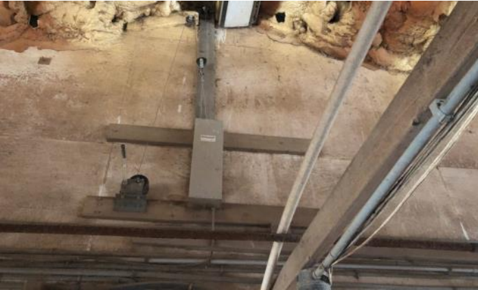
Chimney Vent Control in Site 4