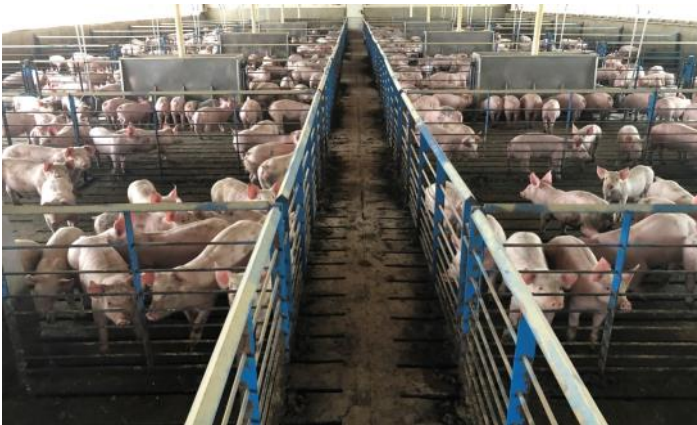
Interior of Site 1