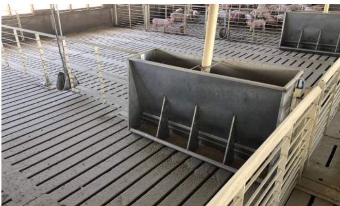
Typical Pen Design