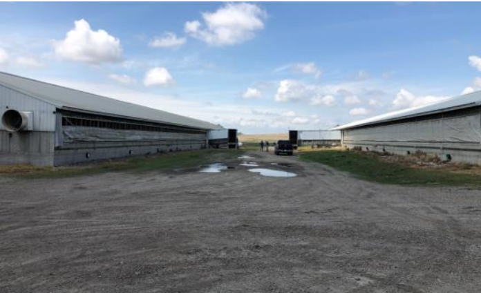
Load-out Chutes Site 8 & 9