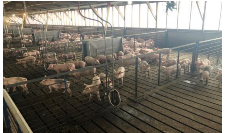
Typical Pen in Site 3