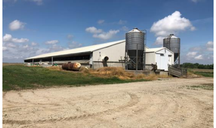
View of Site 2