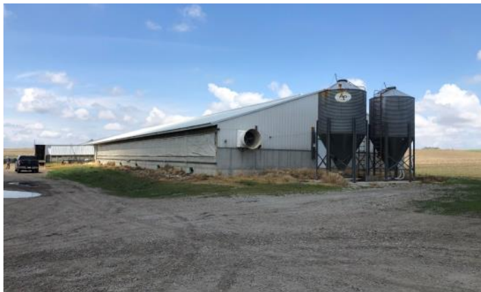
View of Site 9