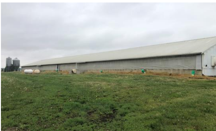
View of Site 4