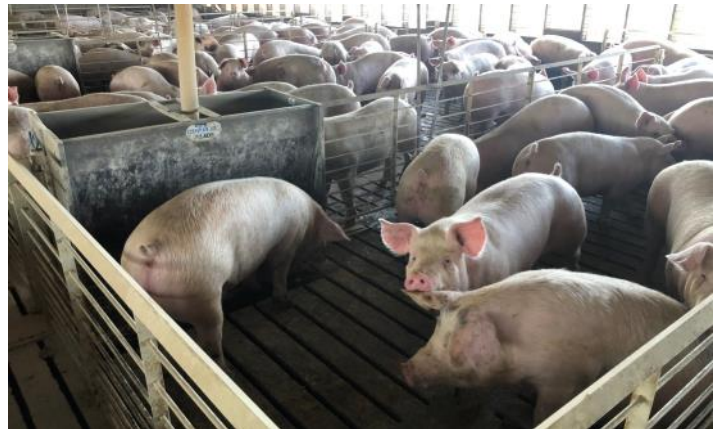
Typical Pen Design