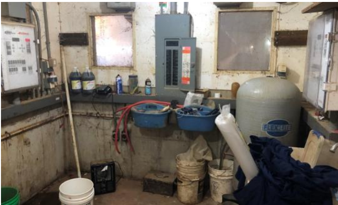
Office Area of Site 5