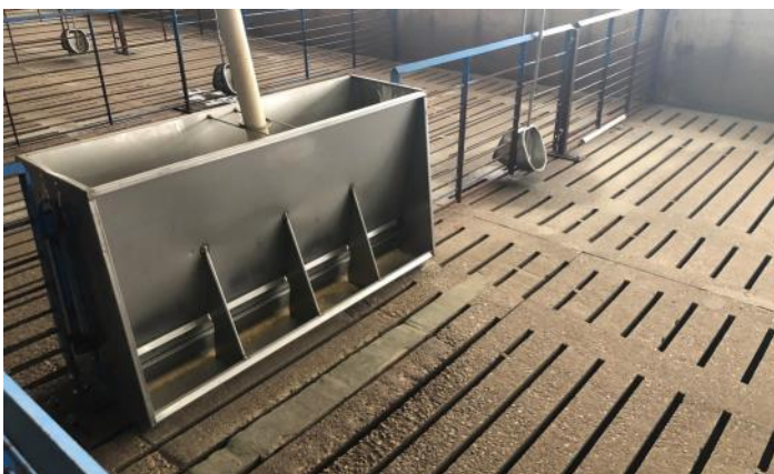
Typical Pen of Site 5