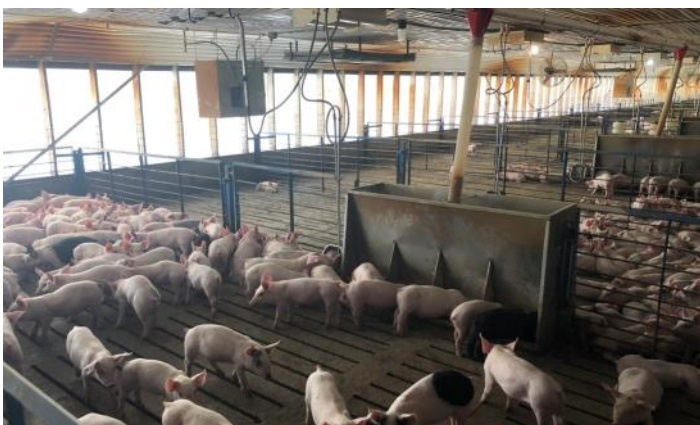
Typical Pen Design