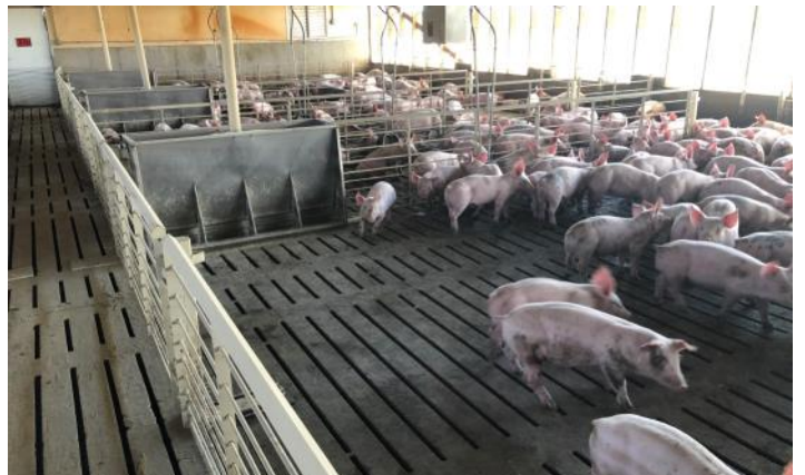
Interior of Site 9