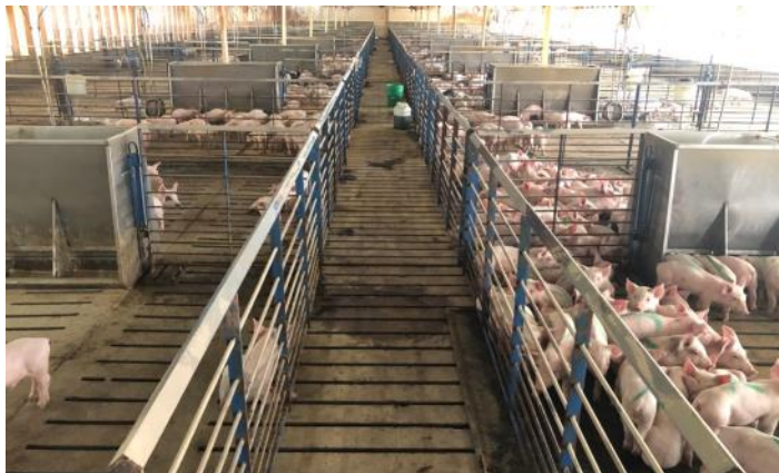
Interior of Site 10