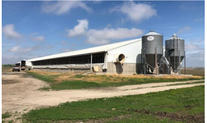
View of Site 7