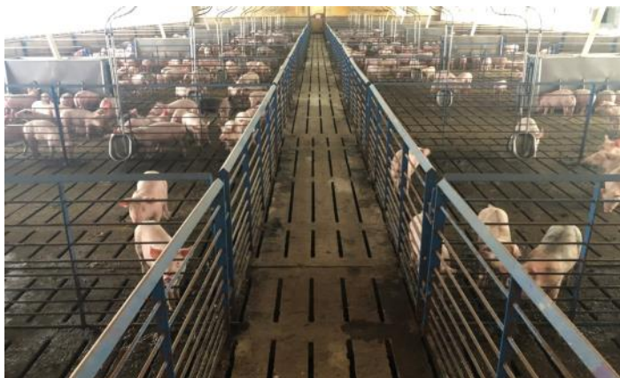
Interior of Site 3