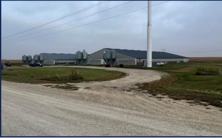
South East View