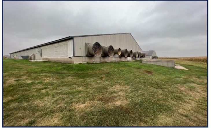
North East View