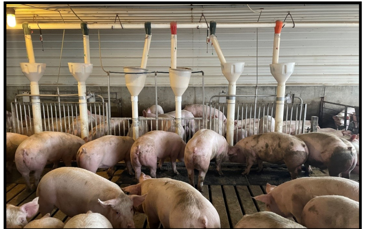
Interior of Finishers