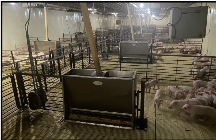
Interior of Nursery