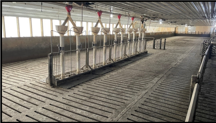
Interior of Finisher Built in 2009