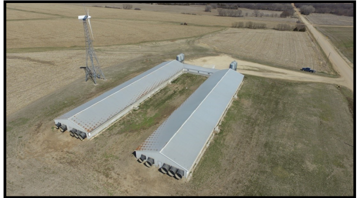
View of Site from the Southwest