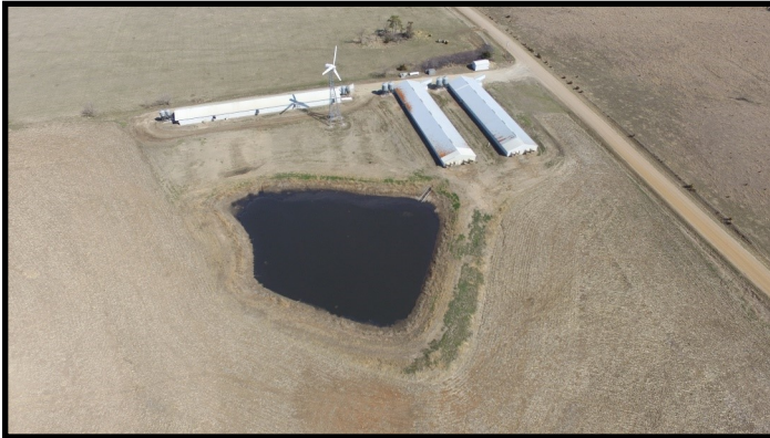
View of Site from the West