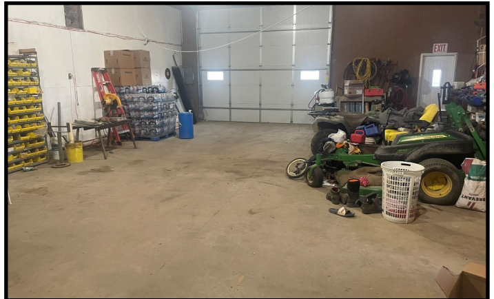
Interior of Shop