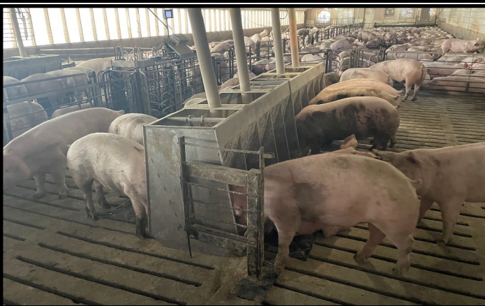
Interior of Finisher