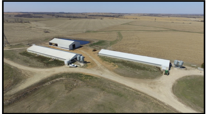
View of Finishers & Compost Shed