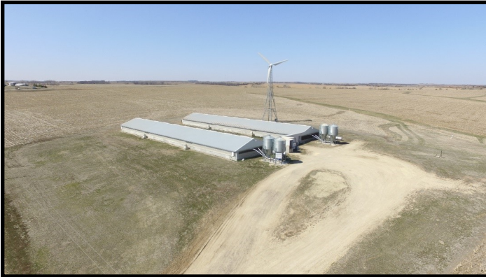
View of Site from the Southeast