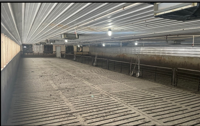
Interior of Finisher Built in 2002