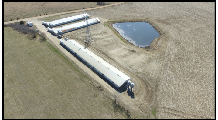
View of Site from the North