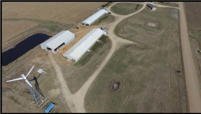
View of Site from West