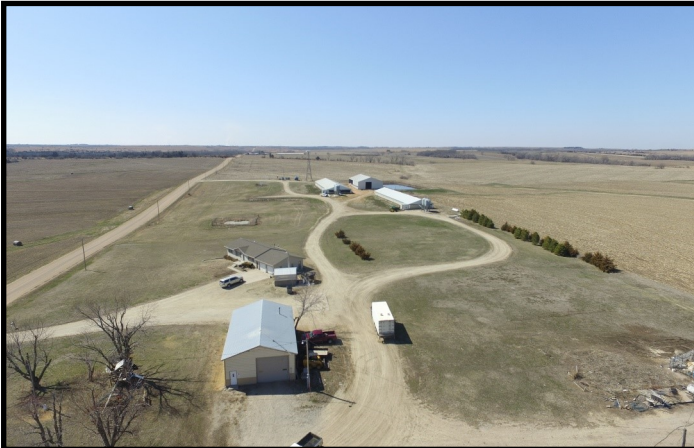
View of Site from East