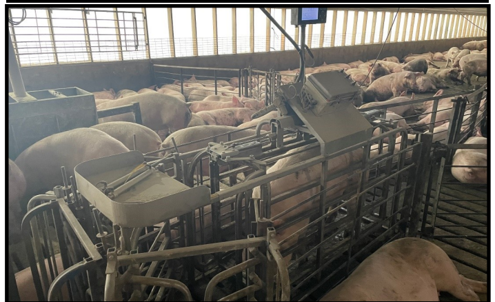
Sort Scale in Finisher