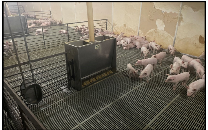
Interior of Nursery