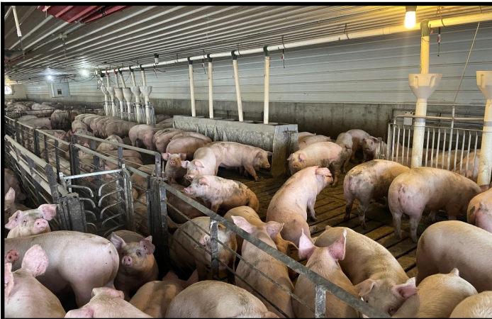
Interior of Finishers