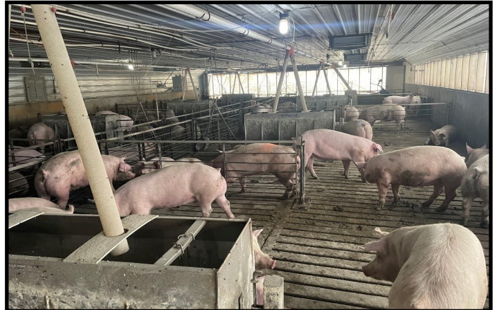
Interior of Finisher Built in 2002