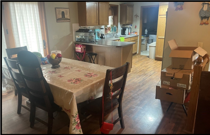
Kitchen & Dining