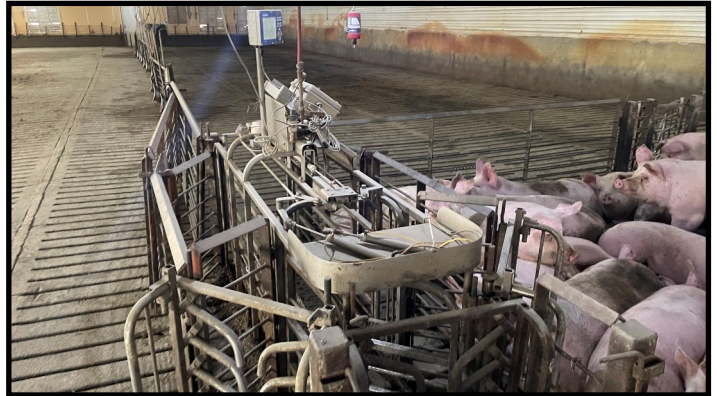
Interior of Finisher Built in 2009