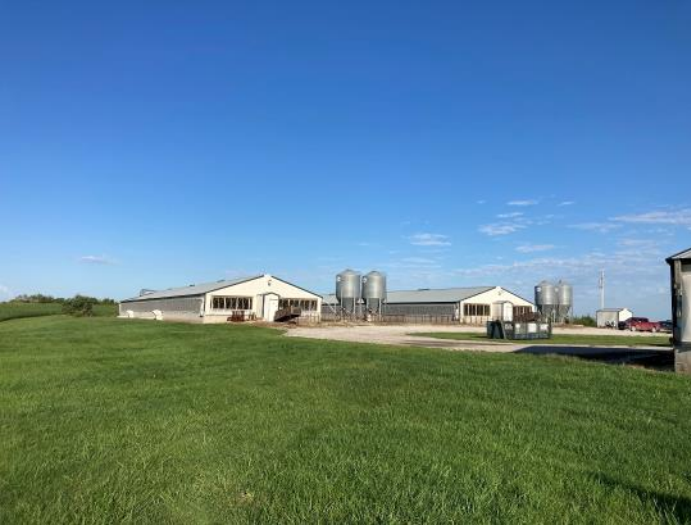
Idaho Ave Site