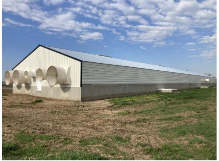
New Exterior, Fans, & Roof