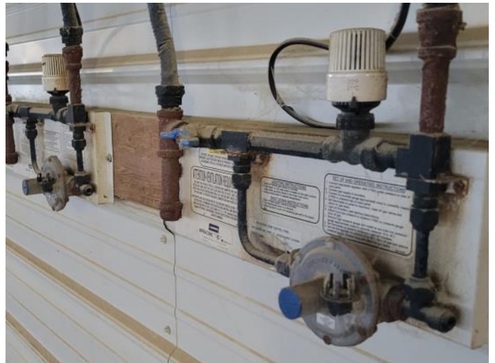
Room Brooder Controls