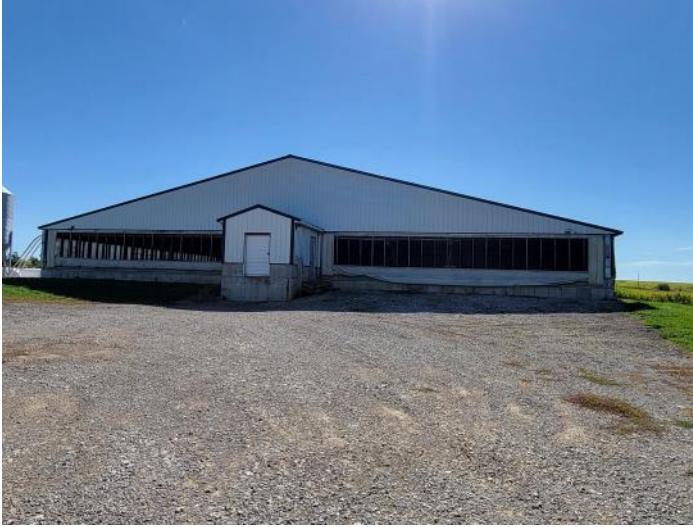
Utah Ave Site