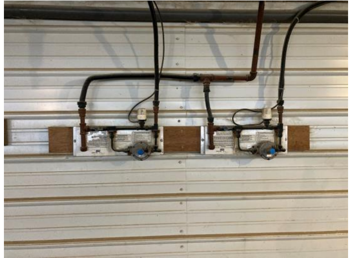
Room Brooder Controls