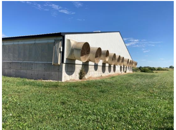
Fan End Wall