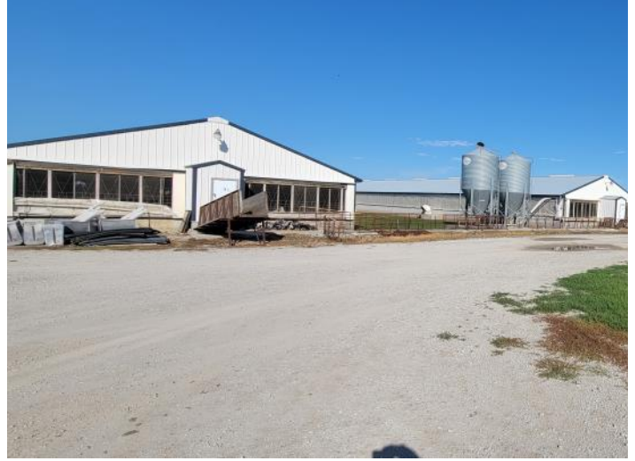
Tunnel Curtain & Load Out