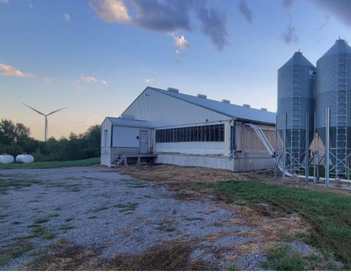
Highland Ave Site