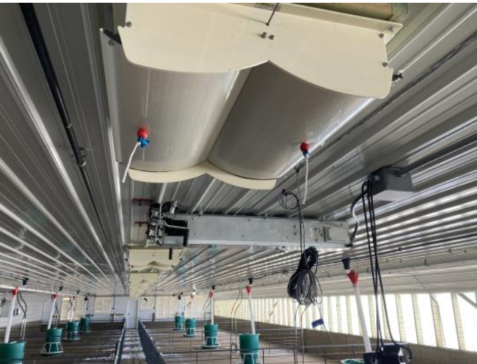
New Ceiling Inlet & Ceiling