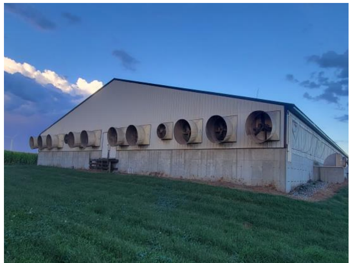
Tunnel Fan End