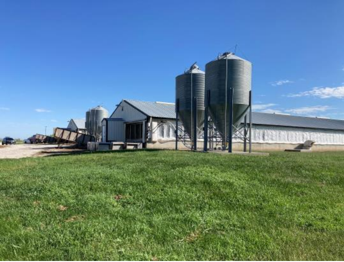
200th St Site