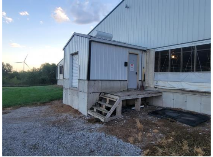
Entrance & Load Out