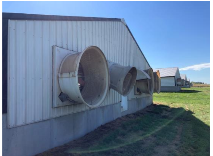
Fan End Wall