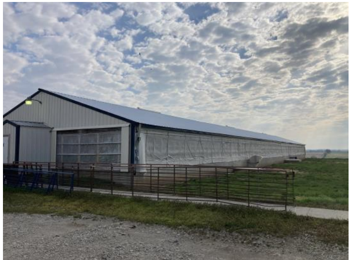
New Curtains & Roof