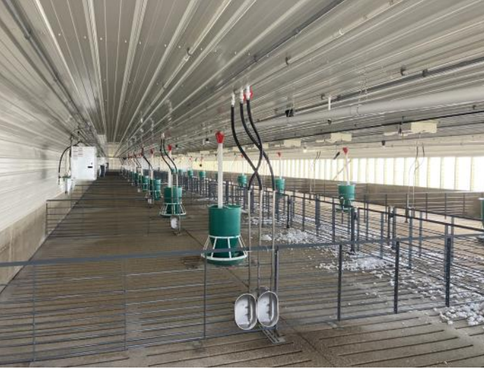
New Feeders, Gates, Feed Lines, & Water Cups