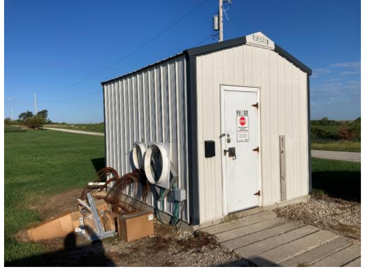
Site Office & Work room