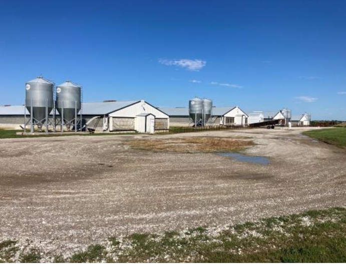
Vail Ave Site