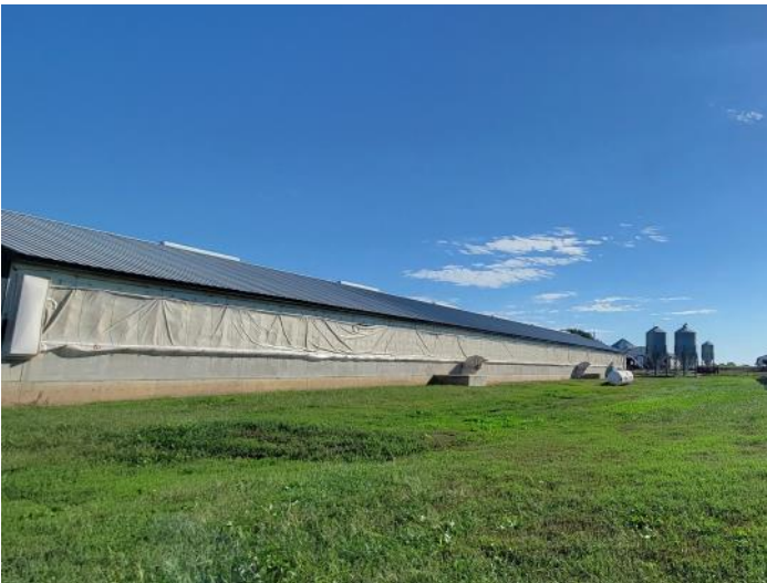
Exterior Side Curtain