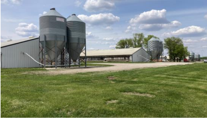
8000 Head Site