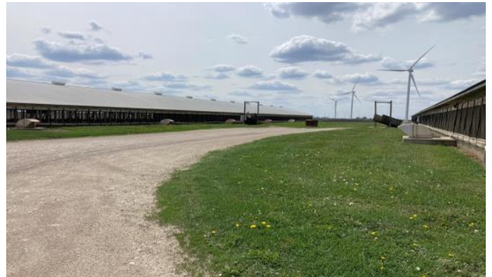
Load out Driveway