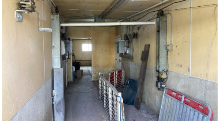
Center Building Loadout