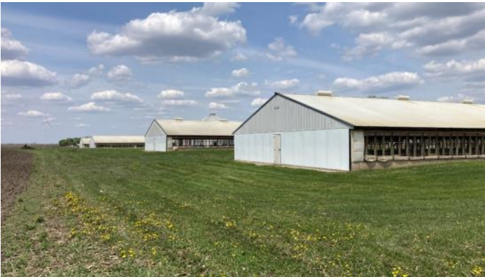
View from SW