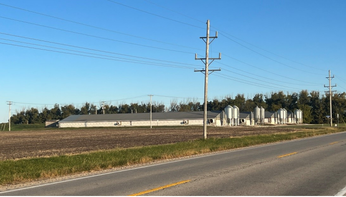
4,194 Head Site