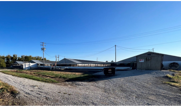
Office and hallway end