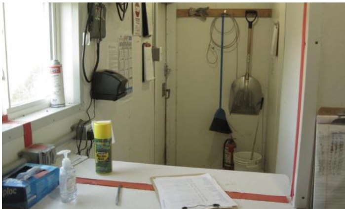
Bio Secure Entrance