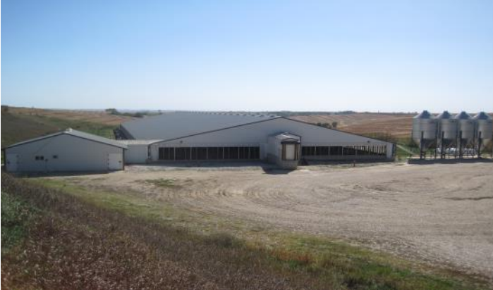
Crawford County Site