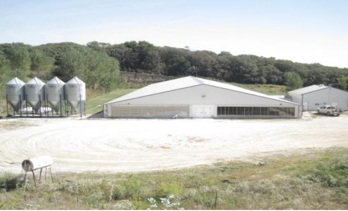
Harrison County Site