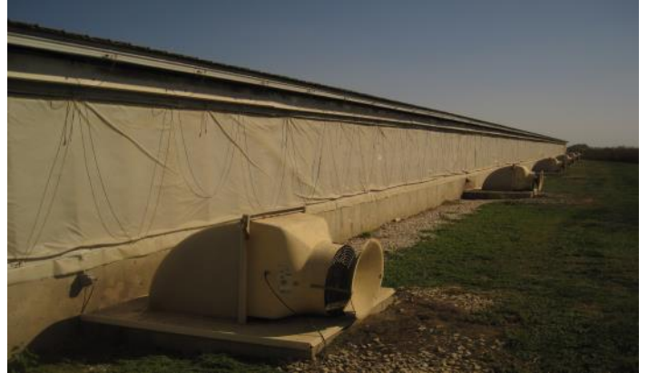
Exterior Side Curtain