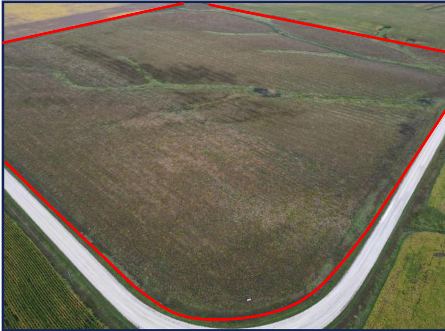
View from the southwest corner looking northeast