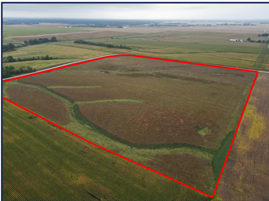
View from the northeast corner looking southwest

The information gathered for this brochure is from sources deemed reliable, but cannot be guaranteed by Growthland or its staff. All acres are considered more or less.