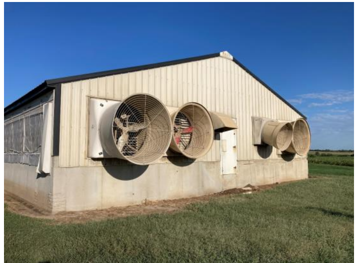
Fan End Wall