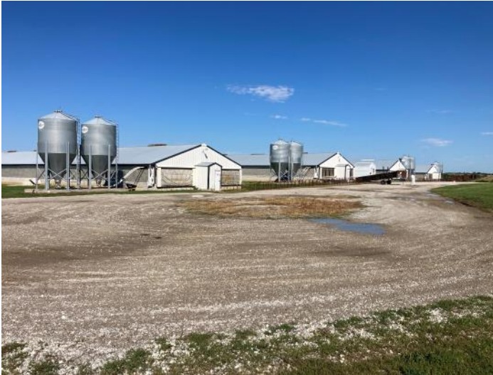
Vail Ave Site