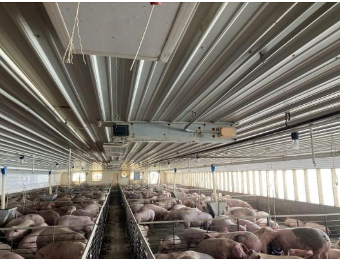
2nd Room View