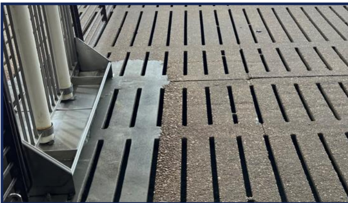
Dry Feeders and Slats