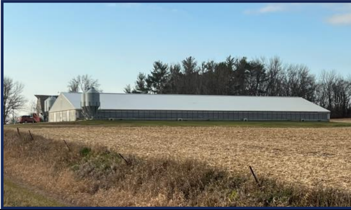
2,000 Head Finish Site