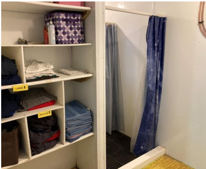
Entrance Walk Through Shower