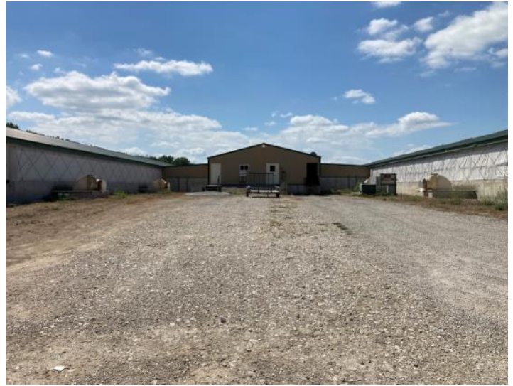
Bio Secure Entrance