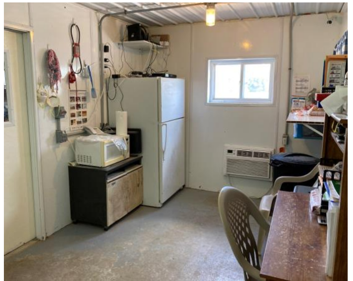
Office & Breakroom