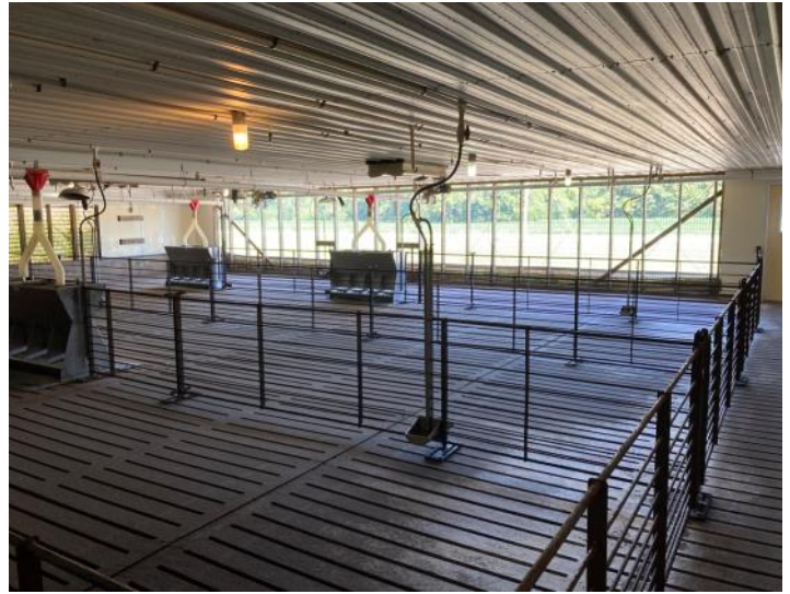
Tunnel Curtain End Wall