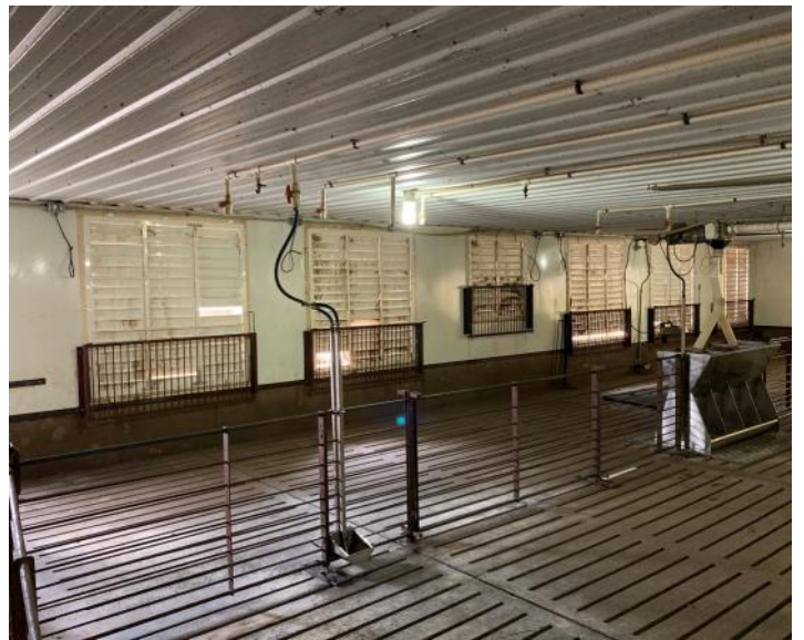
Tunnel Fan End Wall