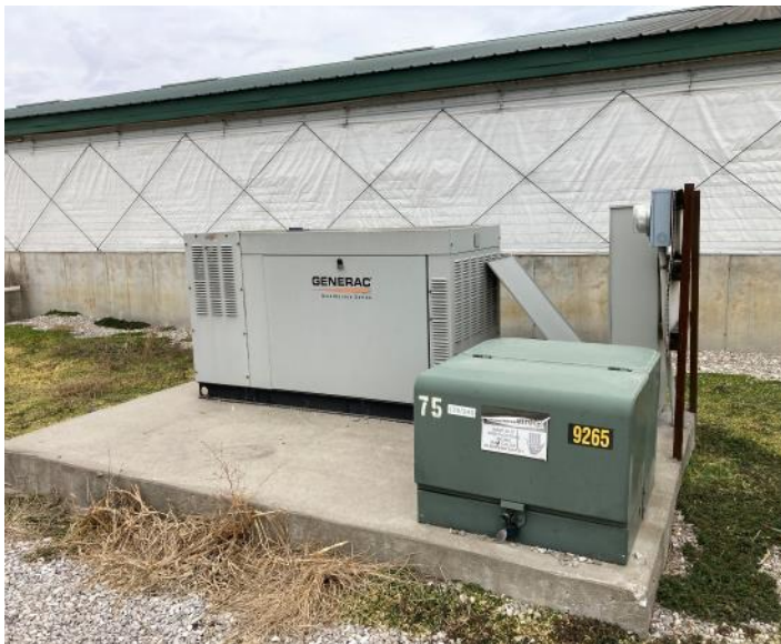
Back Up Generator