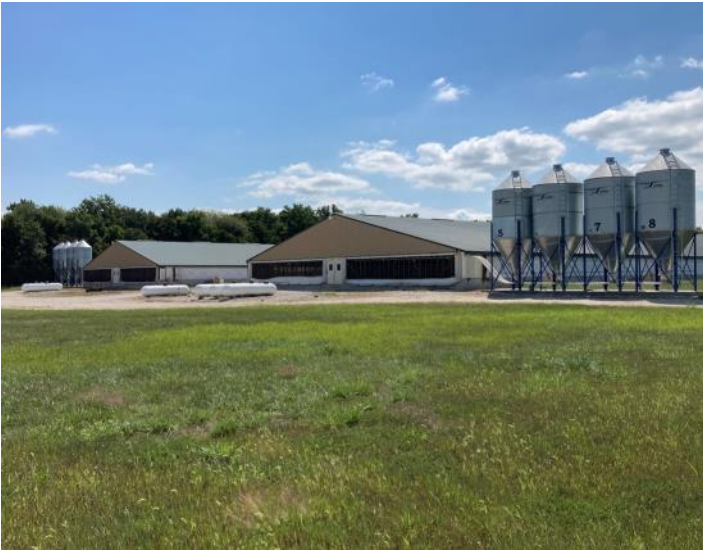
7,200 Head Wean to Finish