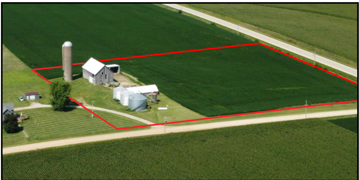
View from the southwest looking northeast

The information gathered for this brochure is from sources deemed reliable, but cannot be guaranteed by Growthland or its staff. All acres are considered more or less.