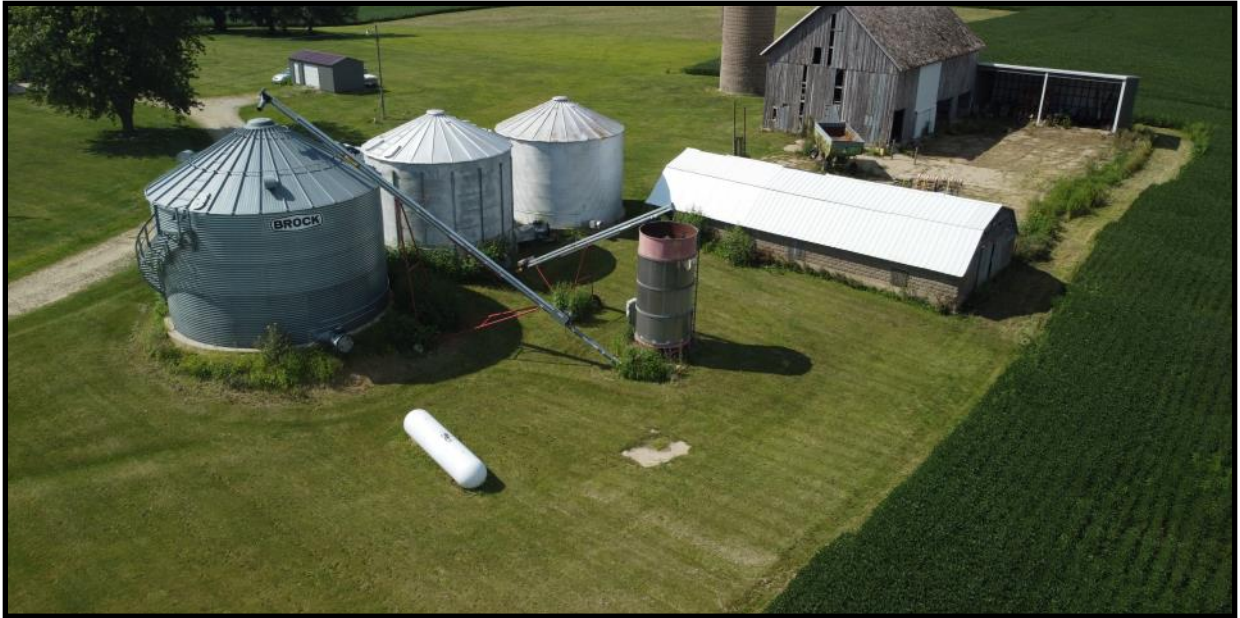
Bins, Dryer, & Barn