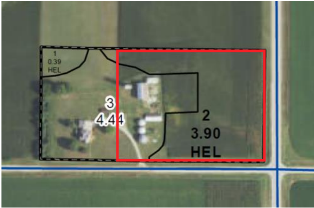
Tillable Soil Map - CSR2