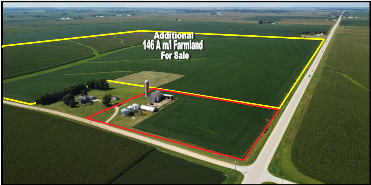
View from the southeast looking northwest including additional farmland for sale