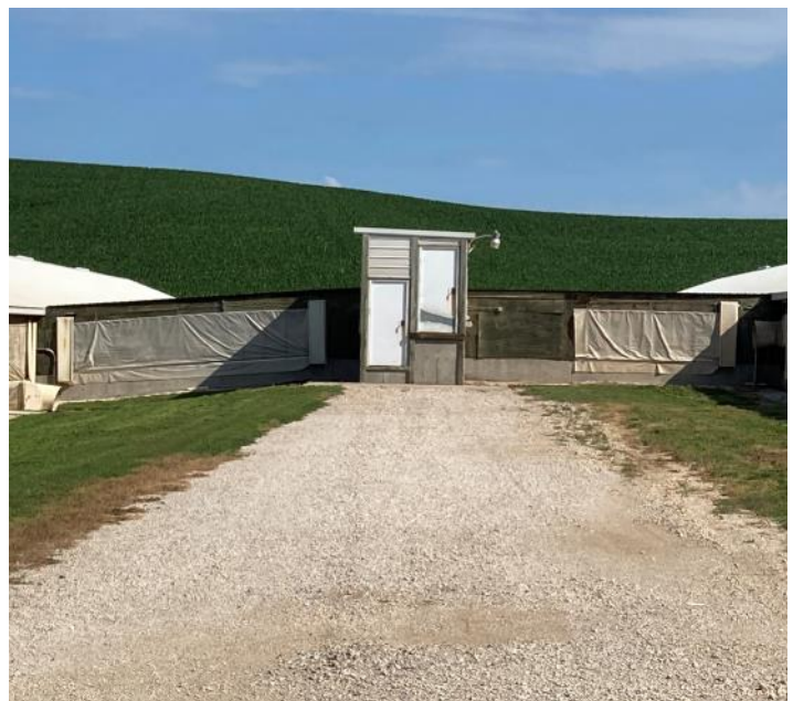
Attached Load Out

The information gathered for this brochure is from sources deemed reliable, but cannot be guaranteed by Growthland or its staff. All acres are considered more or less.