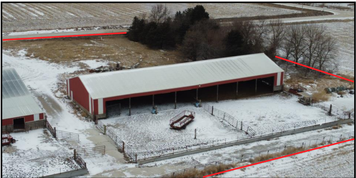
View of the North Half of the Building Site Looking Northwest

The information gathered for this brochure is from sources deemed reliable, but cannot be guaranteed by Growthland or its staff. All acres are considered more or less.