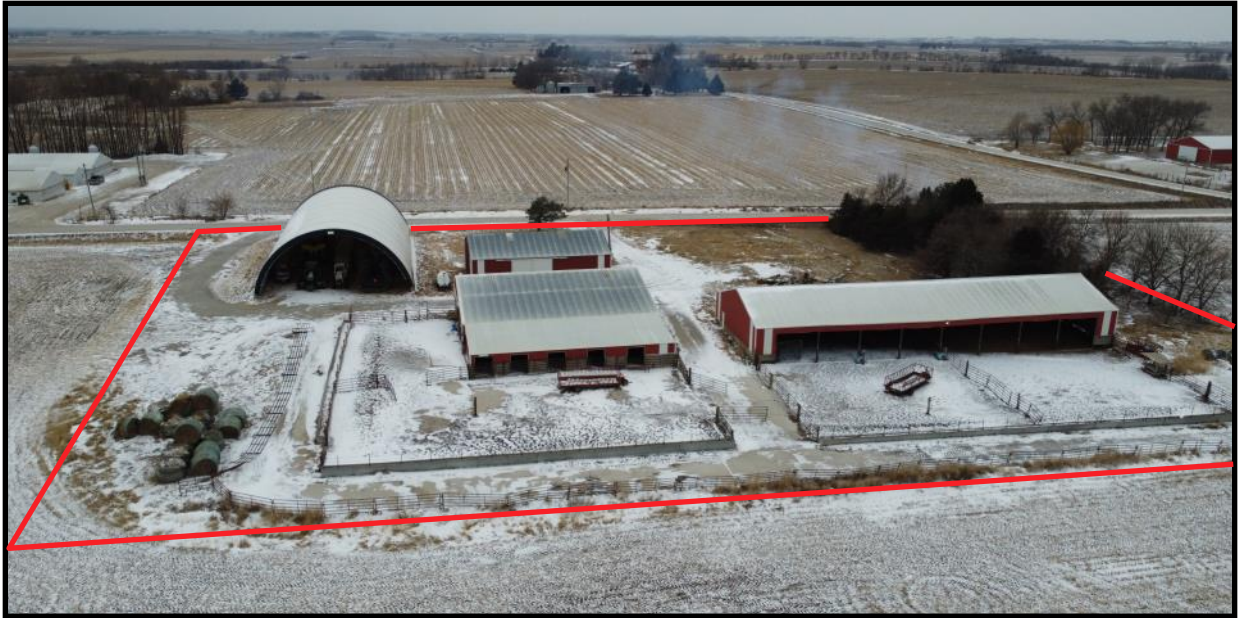
View of the Building Site Looking West