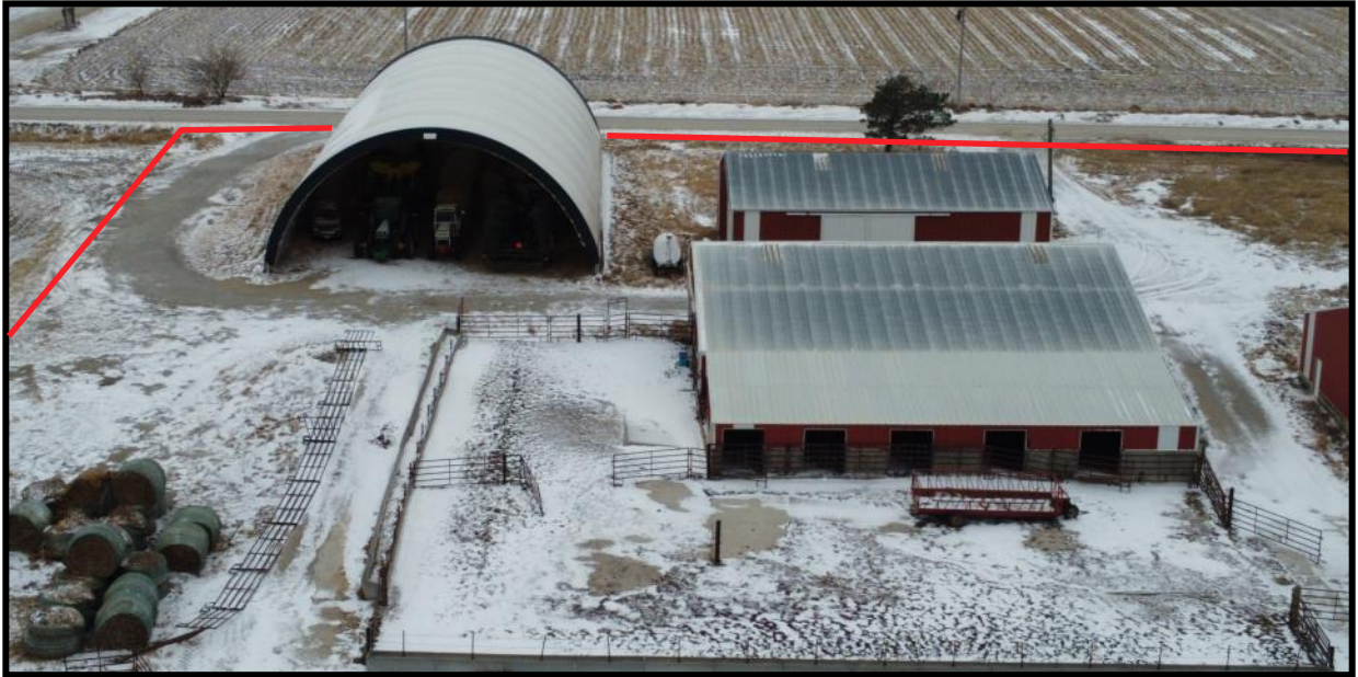
View of the South Half of the Building Site Looking West