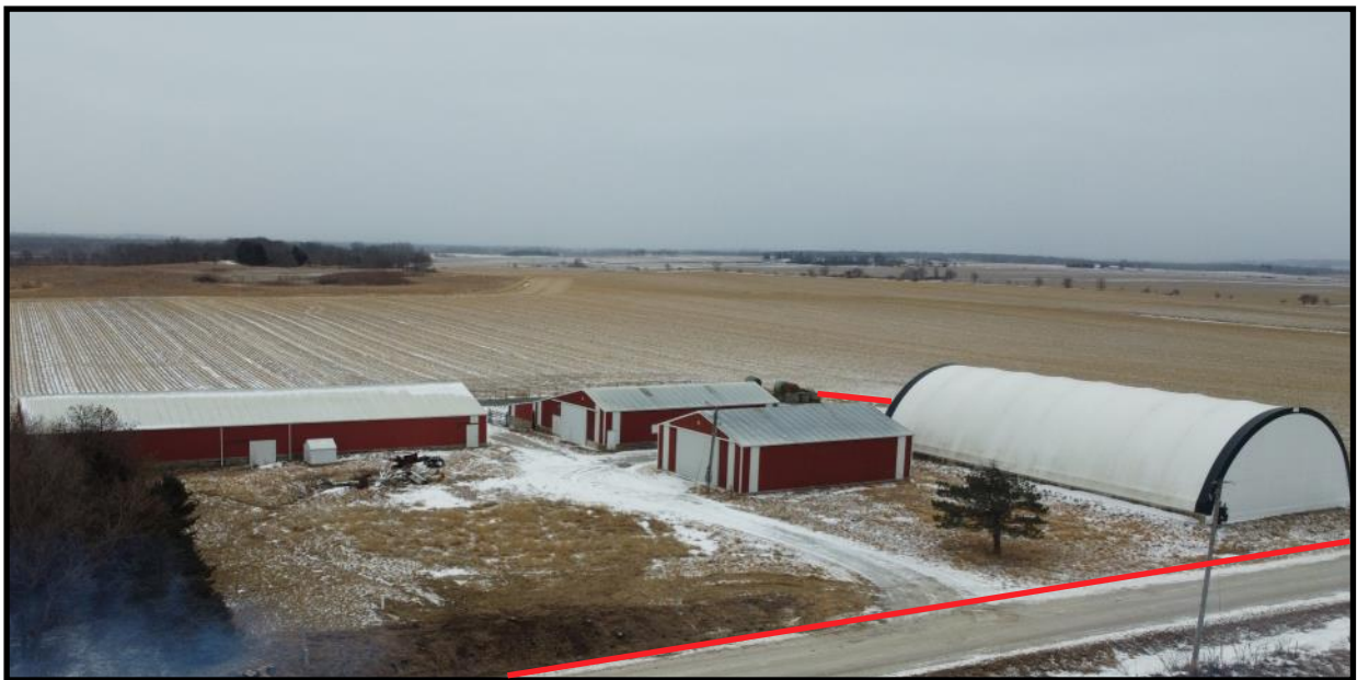
View of the Building Site Looking East

The information gathered for this brochure is from sources deemed reliable, but cannot be guaranteed by Growthland or its staff. All acres are considered more or less.