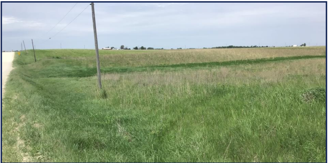
View from the southeast corner looking north

The information gathered for this brochure is from sources deemed reliable, but cannot be guaranteed by Growthland or its staff. All acres are considered more or less.