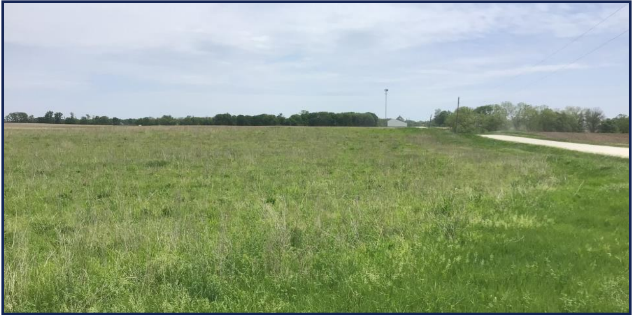
View from the southwest corner looking east