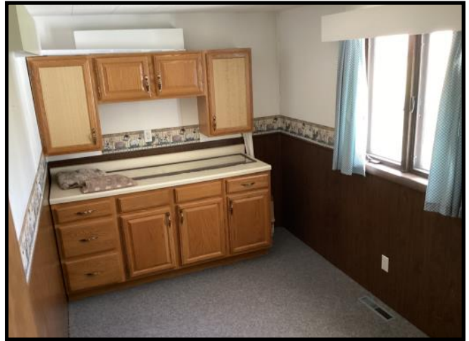
Sewing room or office