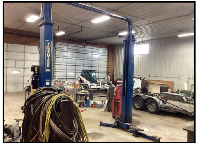
Interior of insulated shop Hoist included LP Heater