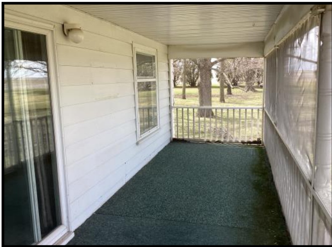
Screened in front porch