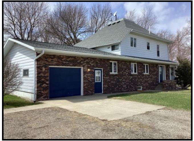
East side of the house and one car attached garage