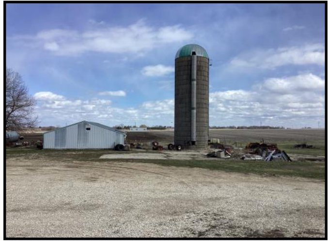
Livestock building with concrete floors and waterlines. cement stave silo currently not being used