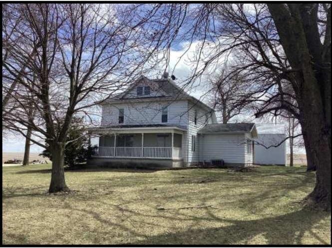
Front of the 2 story, 3 bedroom, 1 1/2 bath house