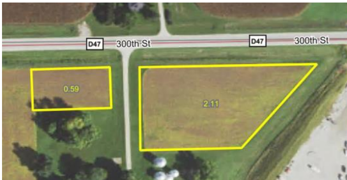
Tillable Aerial Map