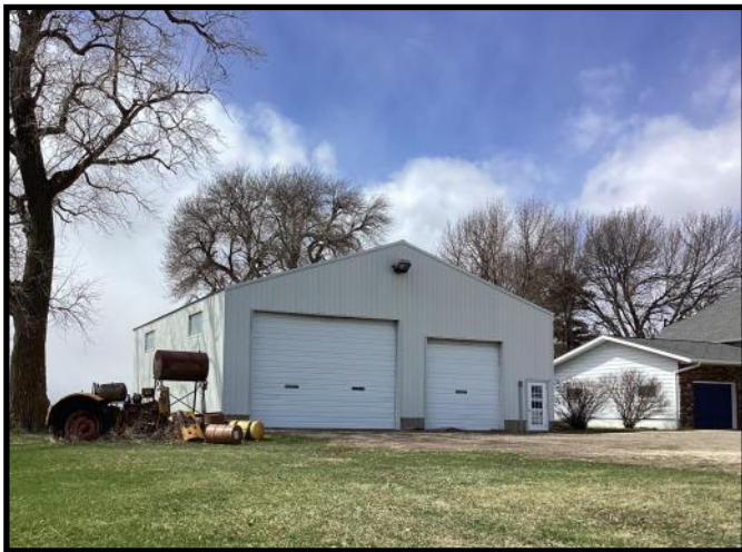
48' x 52' shop with 12'x12' & 14'x20' overhead doors 15 1/2 foot side walls