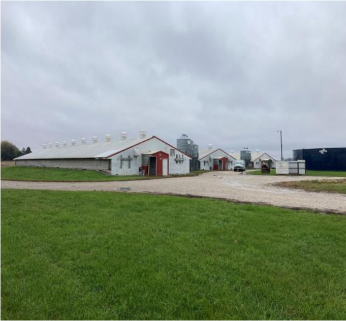
3- 1,100 Wean Finish