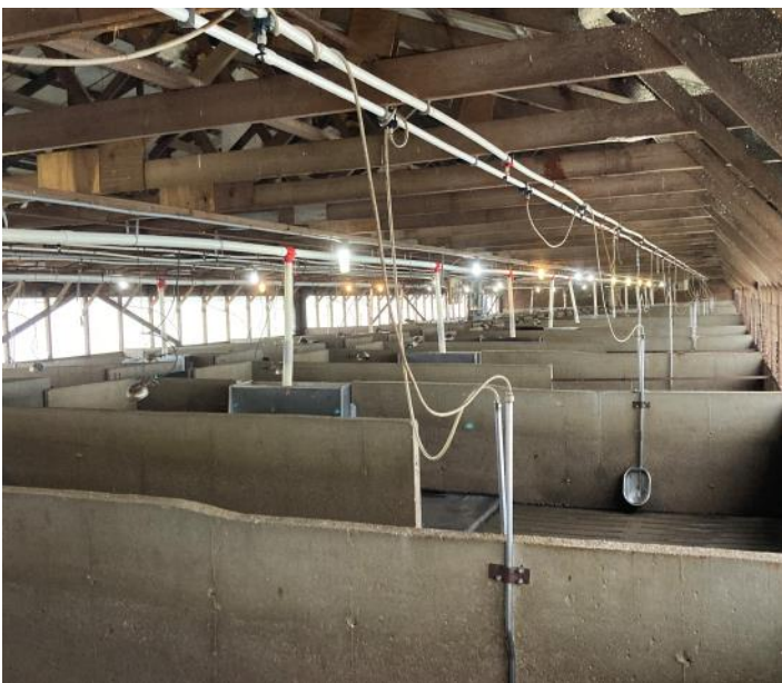
2nd Interior View