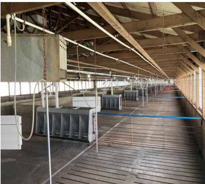
2nd Interior View