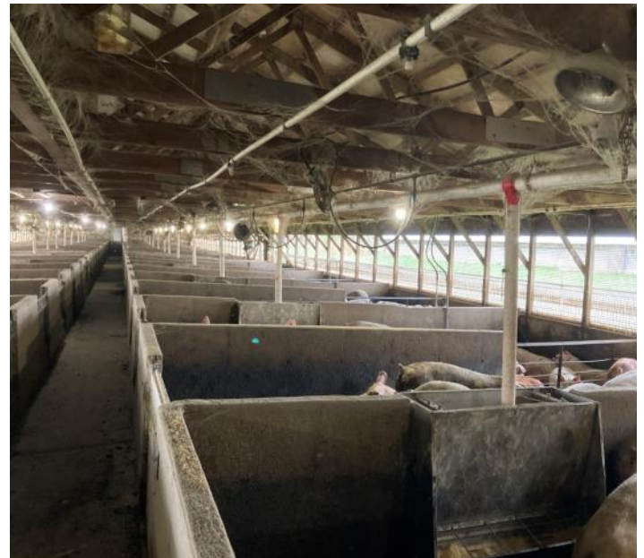
2nd Room View