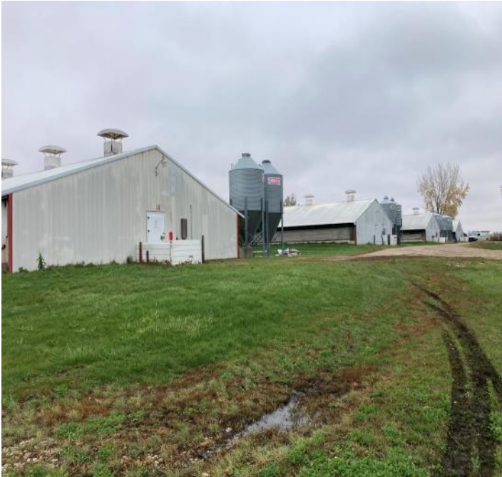
4—1,100 Wean Finish