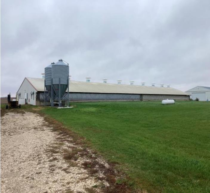
4th—1,100 Wean to Finish