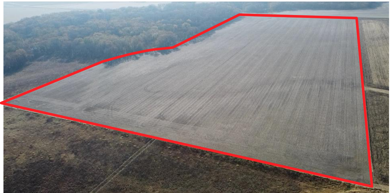
View from the North Looking South

The information gathered for this brochure is from sources deemed reliable, but cannot be guaranteed by Growthland or its staff. All acres are considered more or less.