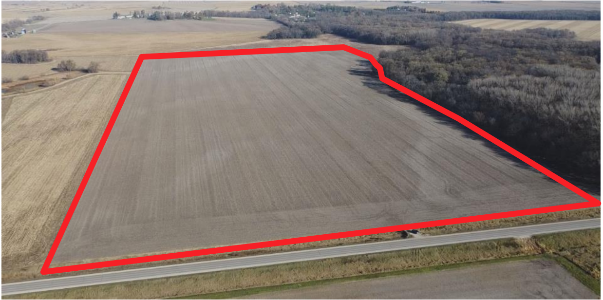
View from the South Looking North