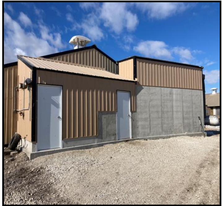
Bio Secure Entry & Load Out