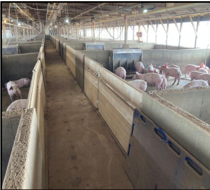
2nd Interior View