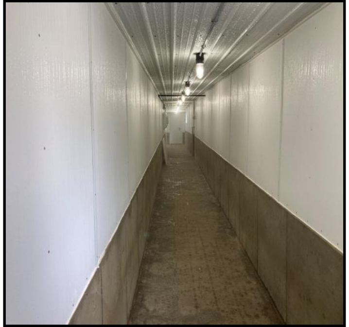
Connecting Hallway & Load Out