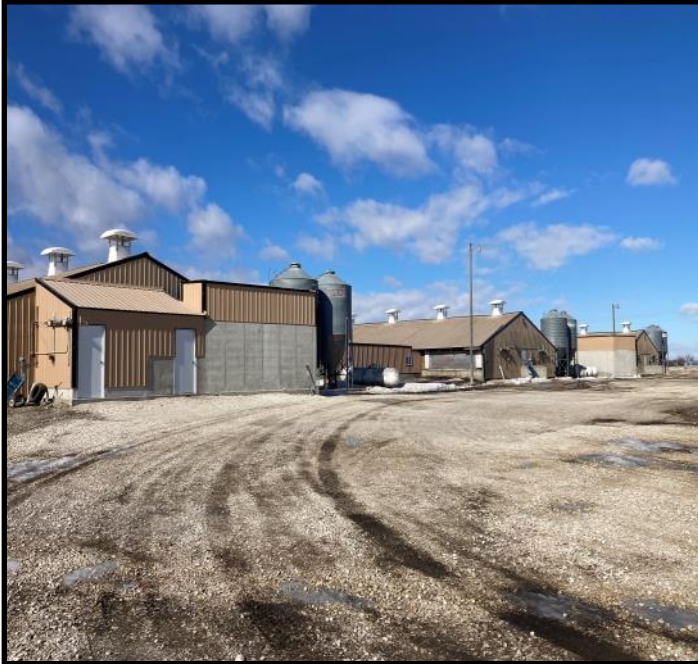
3- 1,100 Wean Finish