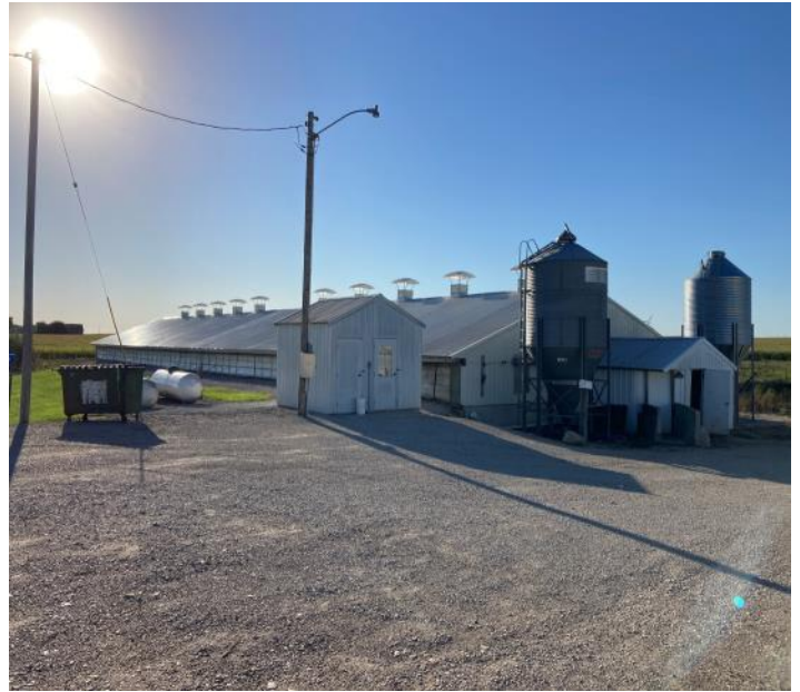
Site Office & East Building