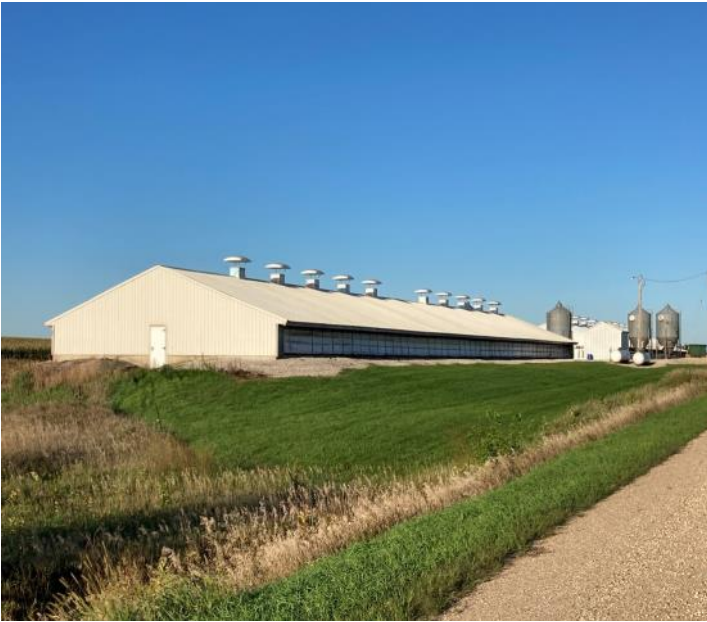
2,200 Head Finish Site