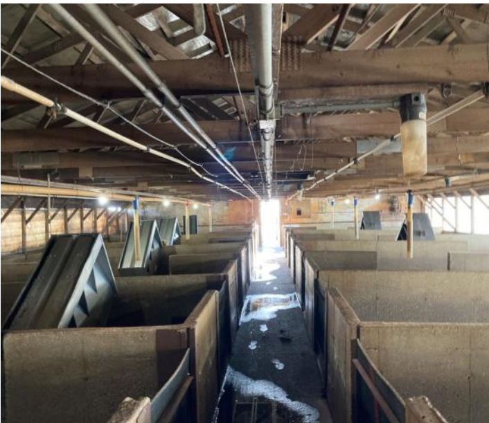
2nd Room View