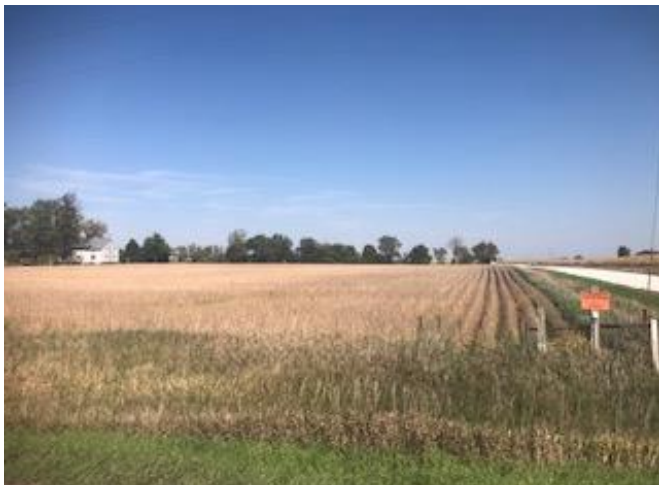
Southeast Corner Looking North