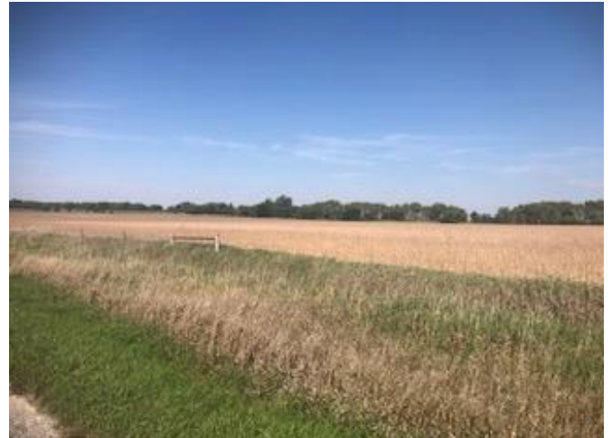
West of Building Site Looking Northwest