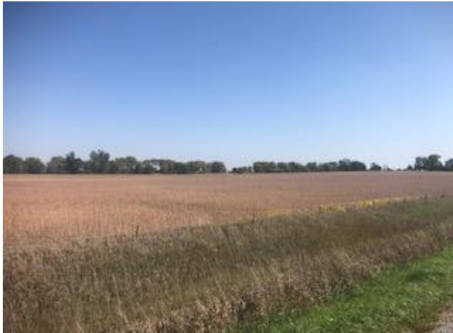
Southwest Looking Northeast