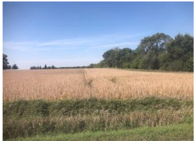
Northeast Corner Looking West