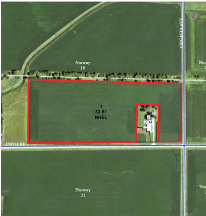
Cropland Soil Map - CSR2