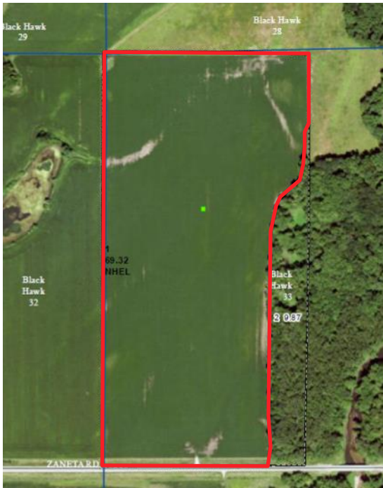
Cropland Soil Map - CSR2