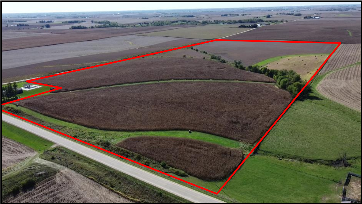
From the Northeast looking Southwest

The information gathered for this brochure is from sources deemed reliable, but cannot be guaranteed by Growthland or its staff. All acres are considered more or less.