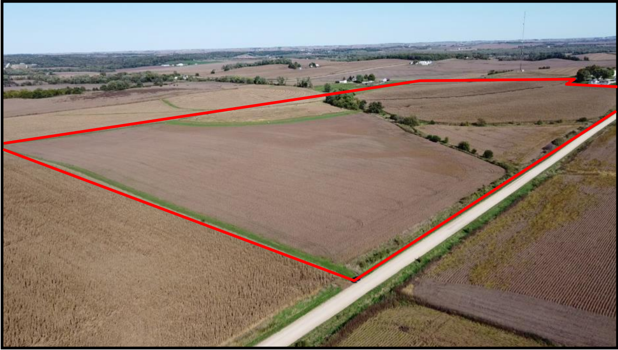
From the Southwest looking Northeast