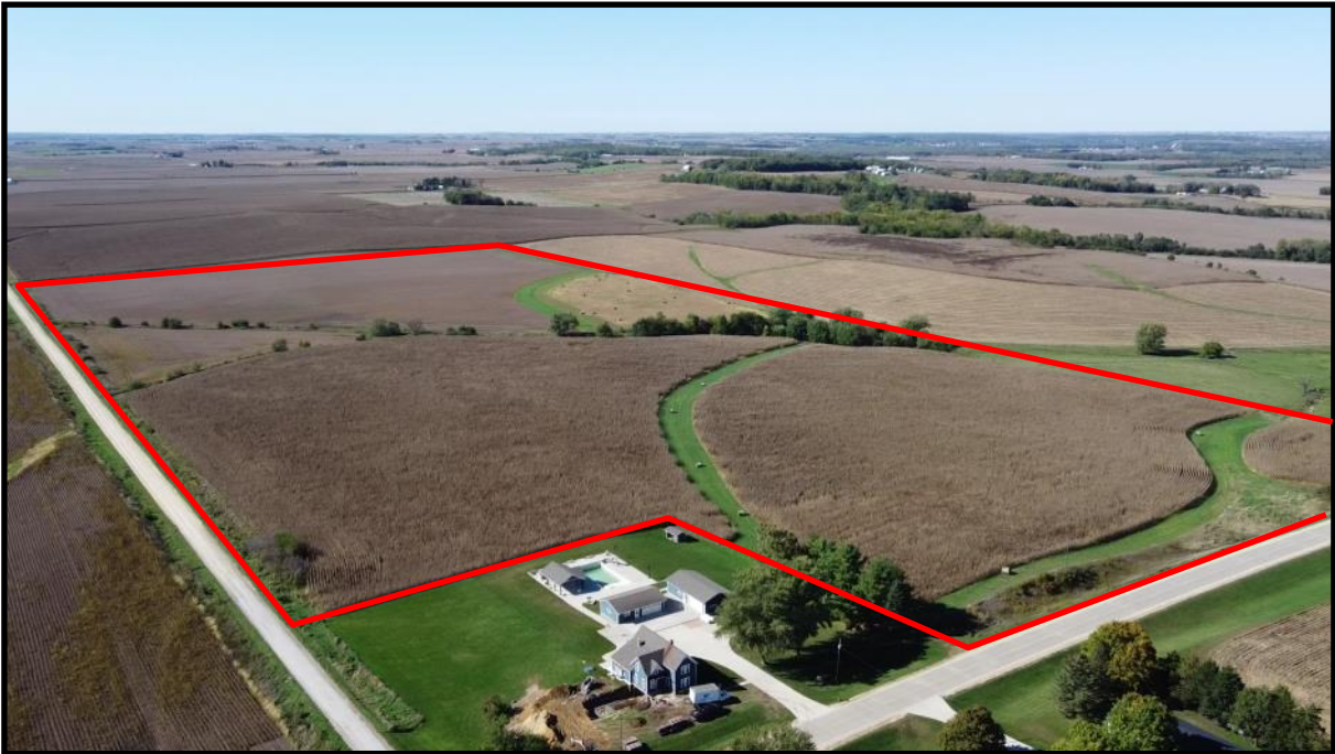
From the Southeast looking Northwest

The information gathered for this brochure is from sources deemed reliable, but cannot be guaranteed by Growthland or its staff. All acres are considered more or less.