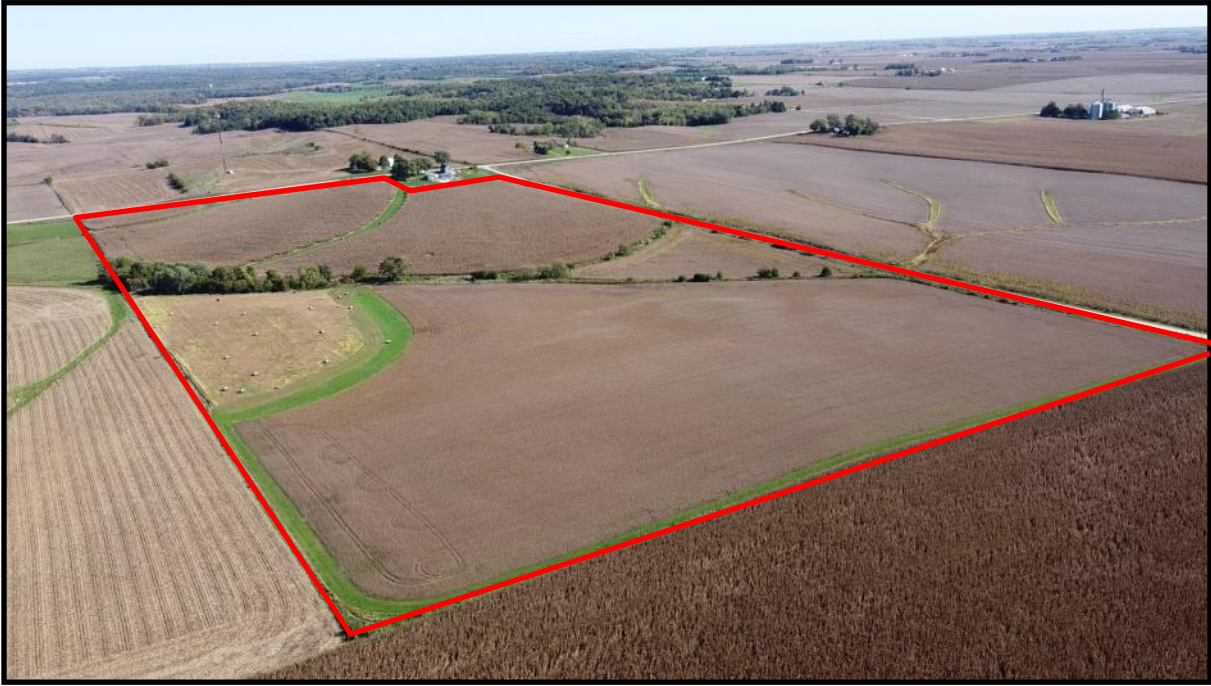
From the Northwest looking Southeast