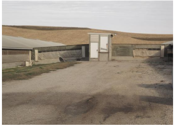
Hi Lo Load Out