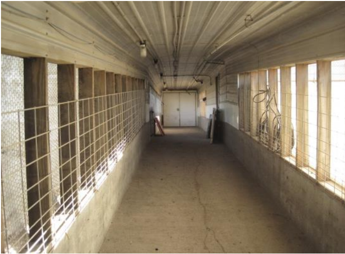
Hall with Loadout